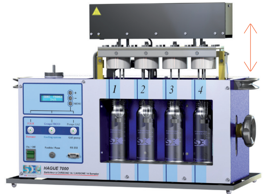
Dynamic opening cabinet of HAGUE 7000