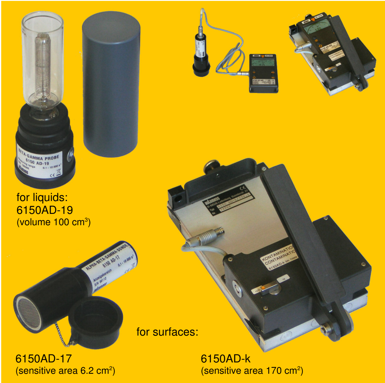
for liquids: 6150AD-19 (volume 100 cm 3 )