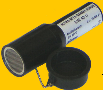
6150AD-17 (sensitive area 6.2 cm 2 )