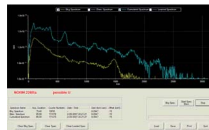
HDSMASS software spectra